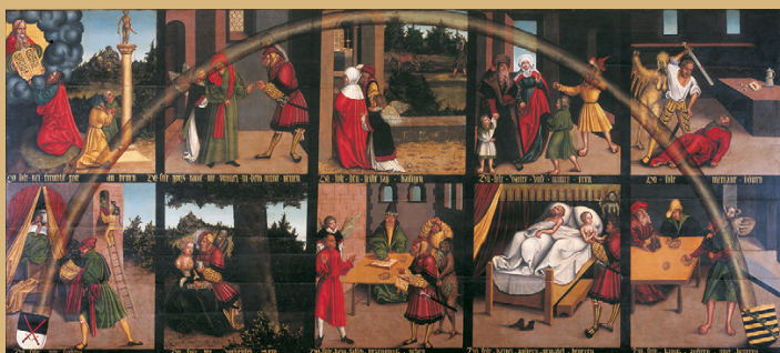
Ten Commandments panel, Lucas Cranach the Elder (Workshop), 1516

The small exhibit in the Melanchthon House presents special works from the Cranach workshop. These include portraits of the reformers as well as illustrations of their works. The highlight is the large Ten Commandments panel, which was commissioned by the Wittenberg Council.